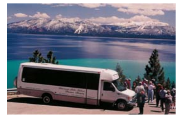
Shuttle Bus Charters