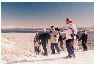
Scenic and Ski Tours